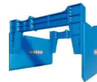
Shield with Steel High Clear Bars