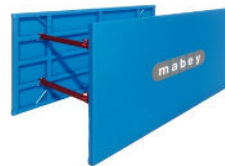
Standard Base with Accrow Struts