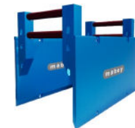
Shield with High Clear Bars