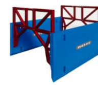
Shield with high clear bars