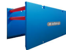
Shield with standard bars