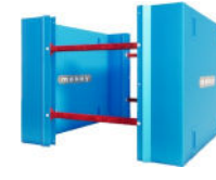
Manhole Base with standard bars