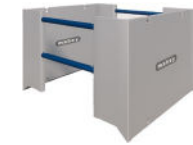
Manhole Base with standard bars