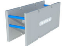
Shield with standard bars