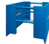
Manhole Base with standard bars