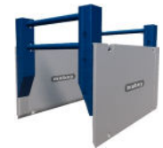
Shield with High Clear Bars