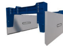
Shield with Steel High Clear Bars