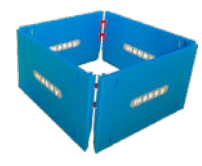
Square box with Corner Spreader